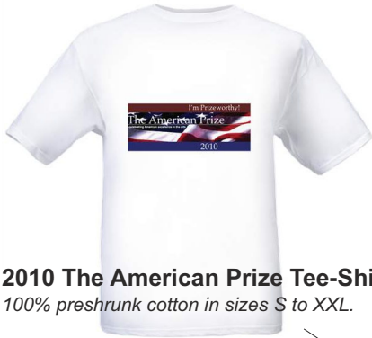
2010 The American Prize Tee-Shirt—$12 100% preshrunk cotton in sizes S to XXL.

Proceeds from the sale of The American Prize merchandise directly support the non-profit competition.