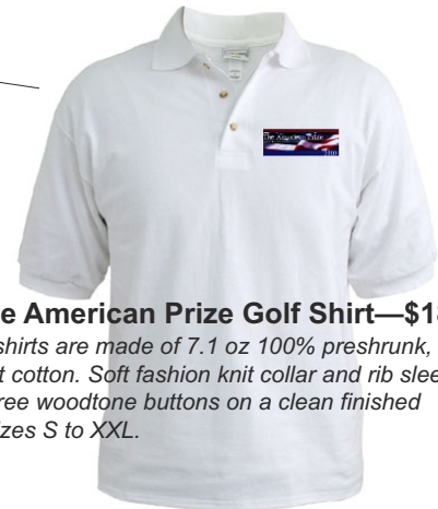
2010 The American Prize Golf Shirt—$18 Anvil golf shirts are made of 7.1 oz 100% preshrunk, mid-weight cotton. Soft fashion knit collar and rib sleeve bands. Three woodtone buttons on a clean finished placket. Sizes S to XXL.